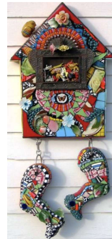
Mosaic by Leann Wooten

Contact: info@wdcc.org / 3900 W Brown Deer Road Suite A PMB 130, Milwaukee, 53209 / Wisconsin