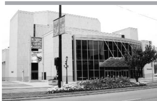
The Marcus Center for the Performing Arts in downtown Milwaukee stands ready for our 31st Annual Morning Glory Craft Fair on Sat.-Sun., August 13-14.